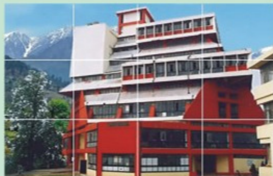
Central Library of the University

Over the years more than 120 students have completed their Ph.D. Degree in Mathematics from the University. In recognition of large number of national and International research publications by the faculty members and other academic initiatives, the department has been selected by the UGC Special Assistance Program (SAP DRS-I) in 2009 and after the assessment of the research work done in the previous phase of the project, the department has been again awarded the DRS-II level w.e.f. April, 2015 to March, 2020.